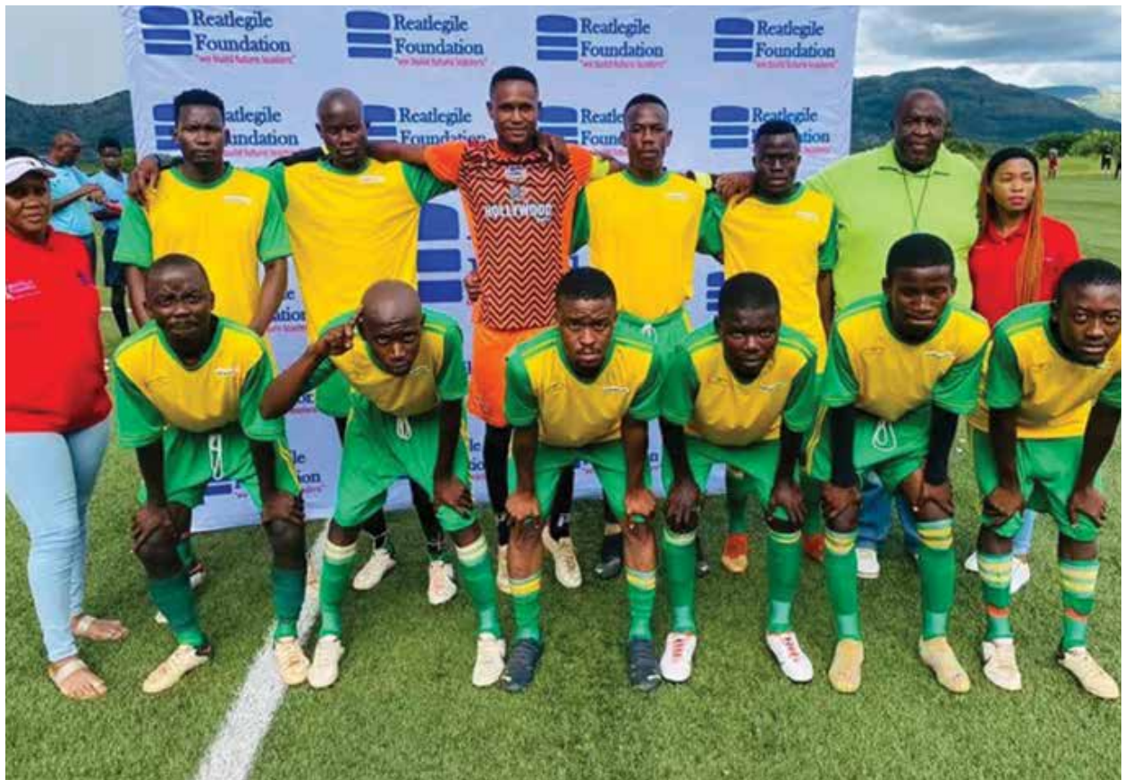
Phasha City Rocks FC is one of the teams adamant to can win the Hollywoodbets Sekhukhune Regional Football League.