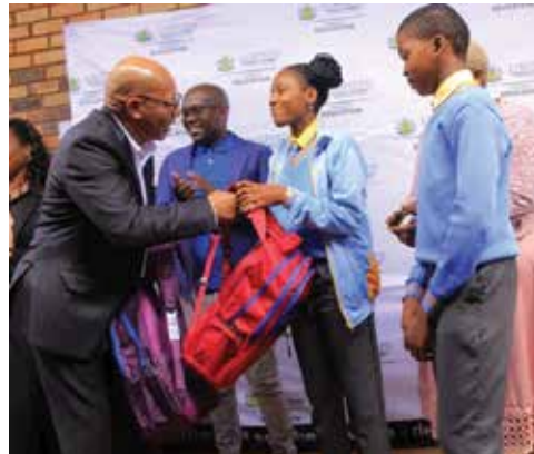
Premier Chupu Stanley Mathabatha handing-over some of donations during the Back-to-School Campaign at Nyaku Secondary School in Atok.

and laptops to underprivileged pupils and the earmarked schools in Sekhukhune Education Districts. According to the Limpopo Provincial Government, the campaign will be proceeding to other districts during January 2024.