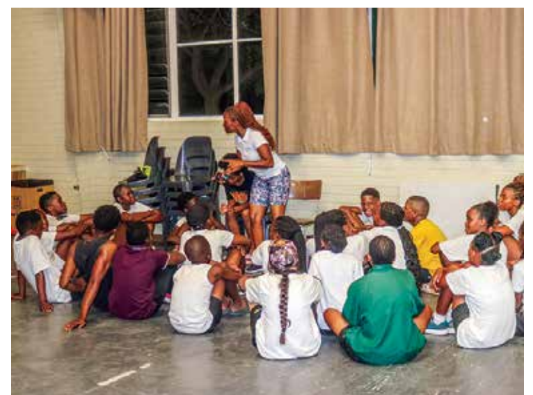
The Grade 8 camp of Ben Viljoen Hogg School had some interesting discussions and introductions in the groups.

Ben Viljoen are sure the new Dallers already feel at home and are looking forward to the best new chapter of their lives!