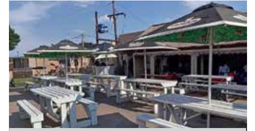
The Police in Siyabuswa are investigating four counts of murder and three attempted murder cases after a mass shooting incident that happened at Chisampama Tavern.