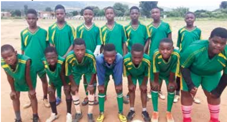
Underground FC started their Hollywoodbets Sekhukhune Regional Football League by defeating Banareng FC 3-1 in their 2024 opening match.